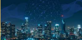
Wisp and Network Application