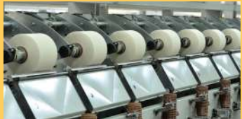
Industrial Machinery Construction